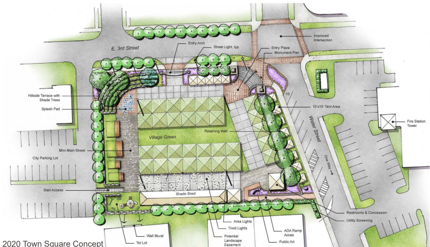
2020 Town Square Concept

* Professional Services by AEW shall be a direct contract with the Rochester DDA (separate of this proposal) per the City of Rochester's' existing service contracts.